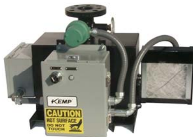
Kemp DBR-3 Dri-Breather Reactivator