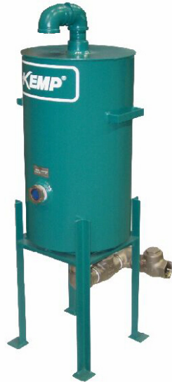
Kemp DB-12 Dri-Breather w/Manifold & Support Frame

When in use, as the liquid storage tank is drained or pumped down, air is drawn into the Dri-Breather through the air inlet. It flows through the desiccant bed and then into the storage tank. Supervision is not required during operation except to periodically inspect the moisture indicator observation port.